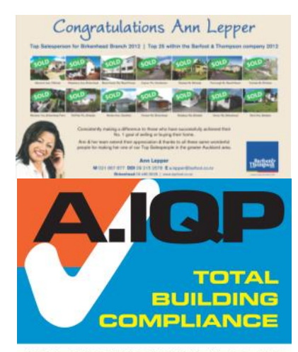
ASBESTOS MANAGEMENT PLANS